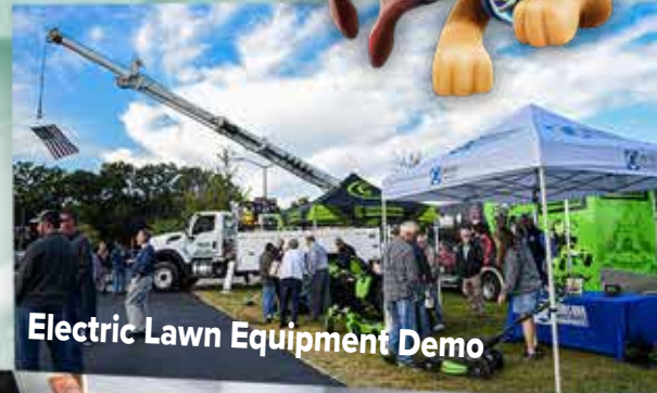
Electric Lawn Equipment Demo